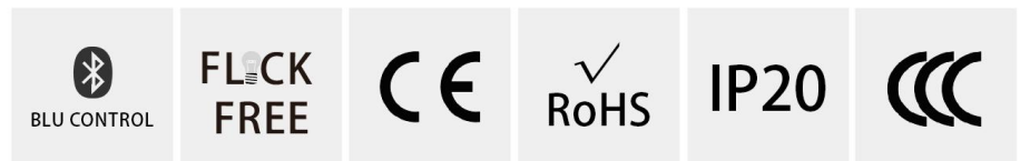
Image may not match reference. EUROLUMEN reserves the right to amend any of the product's components. The data related to flux, power and colour temperature maybe subject to changes made by the manufacturer.