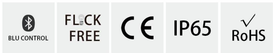
Image may not match reference. EUROLUMEN reserves the right to amend any of the product's components. The data related to flux, power and colour temperature maybe subject to changes made by the manufacturer.